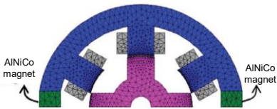
Fig. 1: Structure of the new SRM (upper half)

AlNiCo magnets are known for its high-temperature resistance, thus this new motor performs well even under high temperature ( \leq 200^{\circ}\text{C} ) suitable for automobile applications.